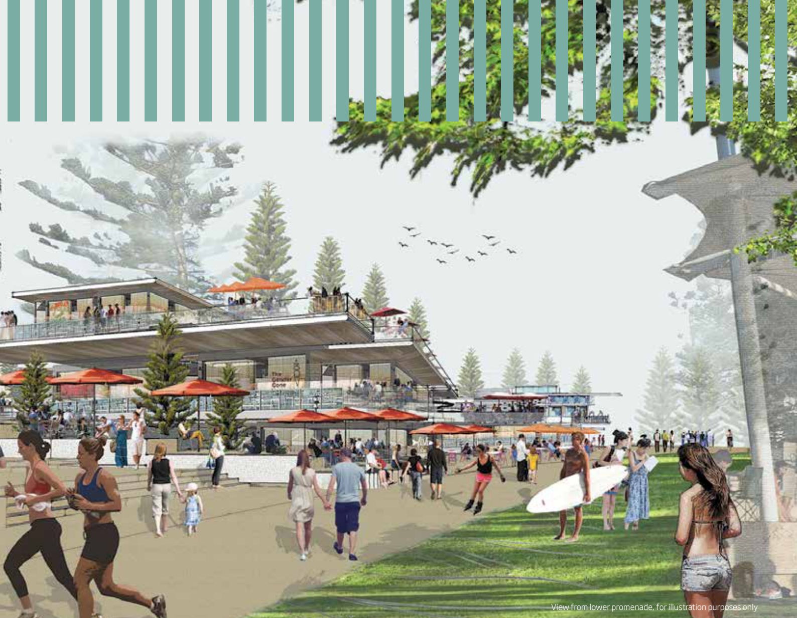
View from lower promenade, for illustration purposes only